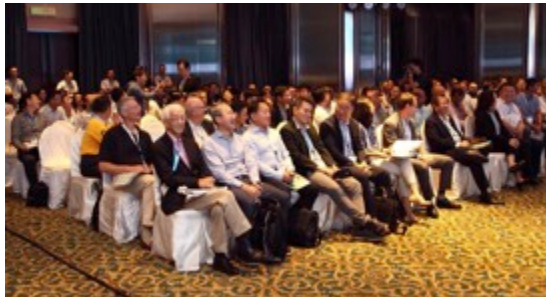
Figure 6: Packed Grand Ballroom for the Opening on 2 nd Day

numbering acronym of CPMT – Components, Packaging and Manufacturing Technologies.