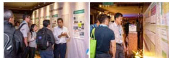
Figure 12: Participants at Posters displayed

All good things have an end (except the sausage which has two) and so it was that the Conference ended after all lucky draw prizes were distributed. Not even the World Cup witnessed so many heartaches in this final session as many of lucky draw winners turned up unlucky, having left the conference early (you know who you are) thus disqualifying themselves from the prizes. After all the laughter and claps, it was time to bring down the curtains on IEMT2018, dubbed the best conference in Melaka, JB and some say Batam. Alas, the bitter-sweet moment of friends and acquaintances having to part ways after a successful conference came to pass but then again, there is always the next conference in two years' time. See you in Putrajaya, Malaysia in 2020!