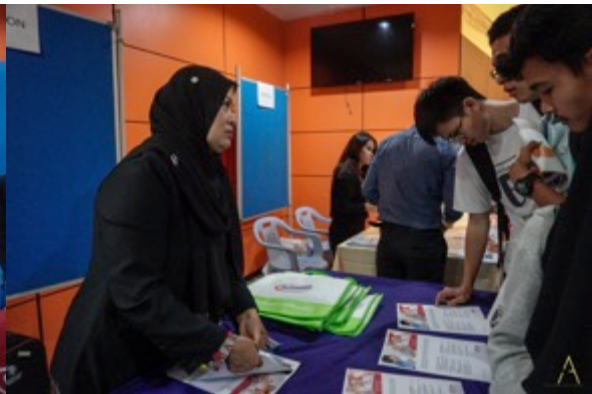
Figure 21: Registration and Information Desk