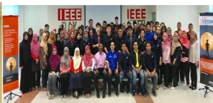
Figure 17: Group photo at UniMAP for IEEE Day