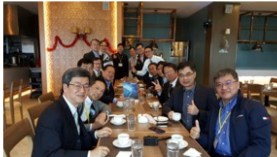
Figure 30: EMAP Steering Committee at lunch