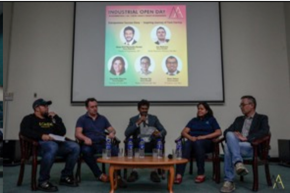
Figure 19: Entrepreneur Success Story session panelists