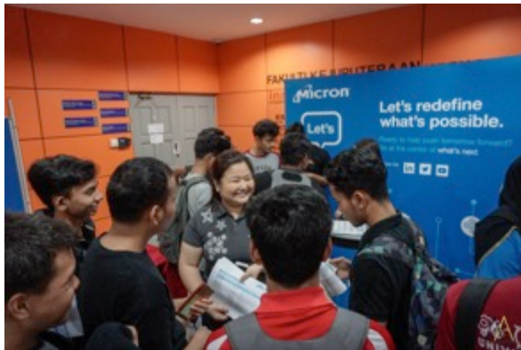
Figure 20: Industry Booth display