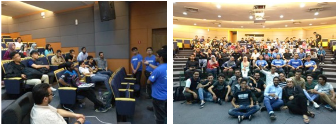
Figure 3: Participants engaged with the sharing (left), and group photo to end the fruitful session (right)

Despite the participants being exhausted, as it was the last program for the long day, the dialogue session was well received. The session was highly engaging, with participants still approaching the young engineers with more questions after the event ended. Many also come to personally thank the young engineers for their time and praising the sharing as motivational.