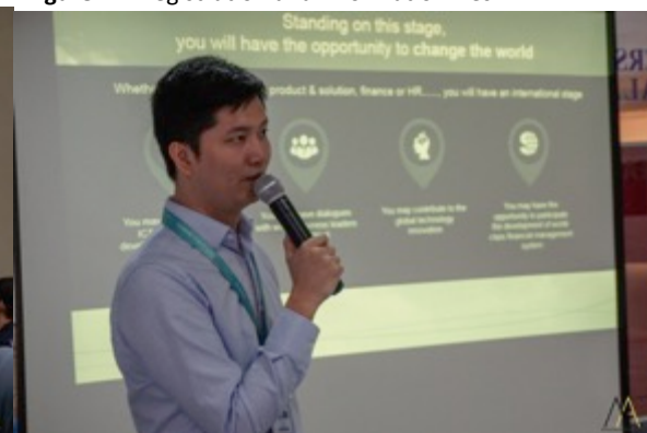
Figure 23: Inspiring students to change the world