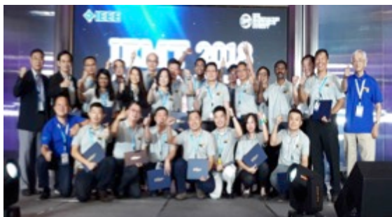
Figure 4: The IEMT 2018 Organizing Committee

Volunteers from three sectors: local multinational semiconductor companies such as Infineon Technologies, Intel, ON Semiconductor, Carsem, Atotech, Lumileds, NXP, STMicroelectronics and Tactilis, local universities Universiti Kebangsaan Malaysia (UKM), Universiti Teknologi Malaysia (UTM) and Universiti Sains Malaysia (USM) along with the semi-governmental body CREST (Collaborative Research in Engineering, Science & Technology), formed the organizing committee that would bring the conference to fruition. 15 months of hard-work, enabled by multi-party conferencing, sprinkled with a gamut of emotions ranging from anticipation to angst and disappointment to delight, overtly fueled by the desire to bring the best conference to the society (covertly driven by the fear of failure), culminated in the 3-day Conference held from 4 th to 6 th September 2018 at the Ramada Plaza Hotel in the heart of Melaka city.