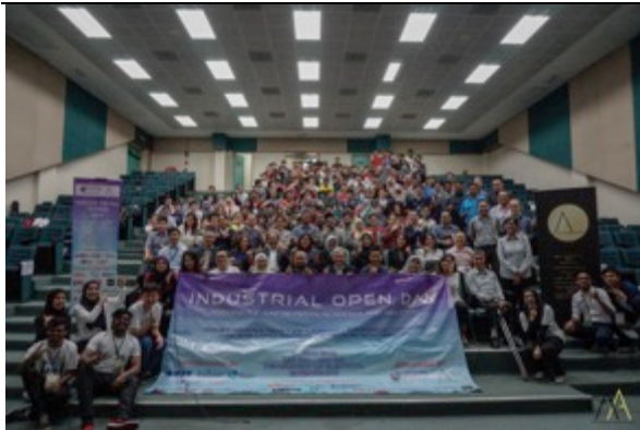
Figure 18: Group photo of the participants