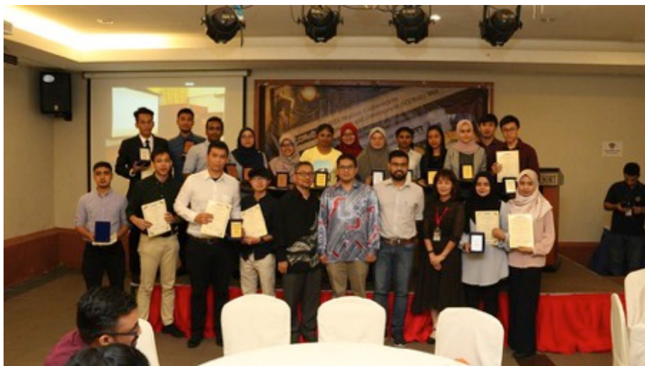
Figure 28: The Award winners, their supervisors and the judges