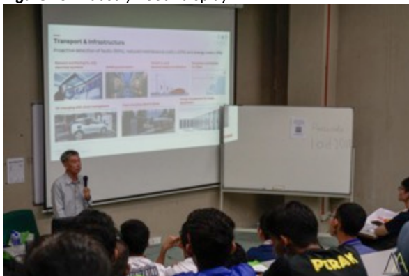
Figure 22: Students in one of the parallel session talks