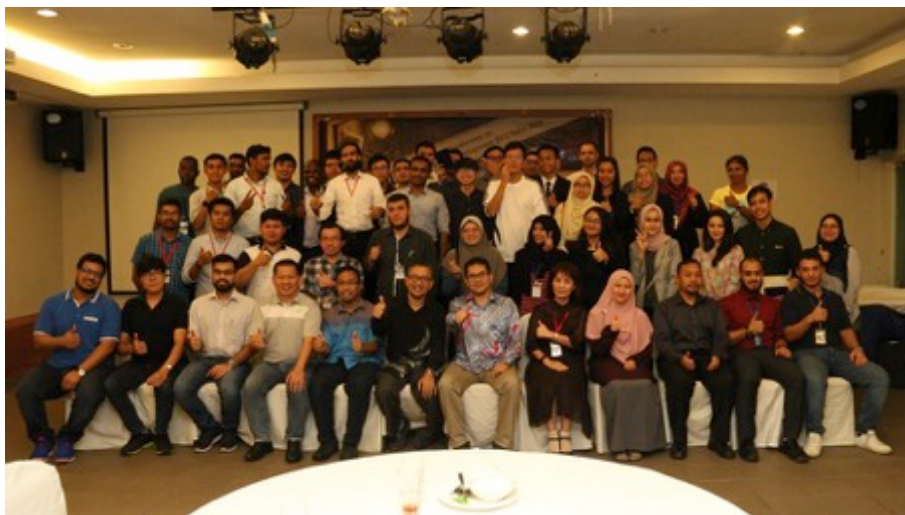
Figure 27: Electronics Packaging Track Group Photo