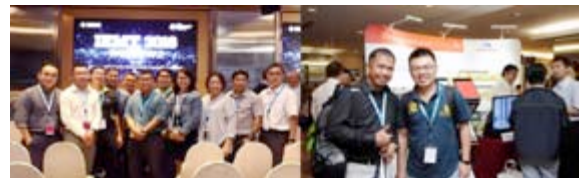
Figure 13: Group and individual photos at IEMT 2018